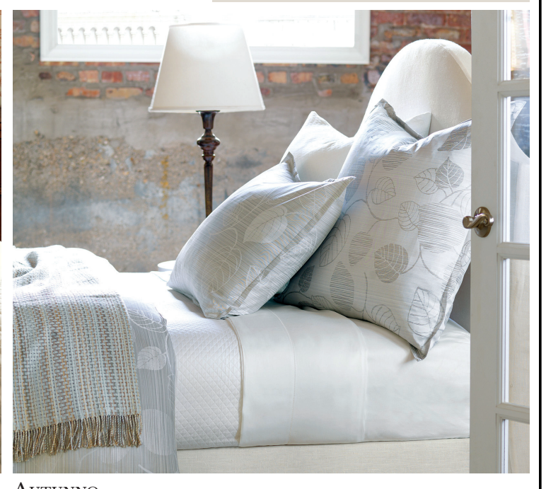
AUTUNNO Inspired by Fall's refreshing crispness, Autunno features an elegant striaed jacquard pattern of swirling autumn leaves.